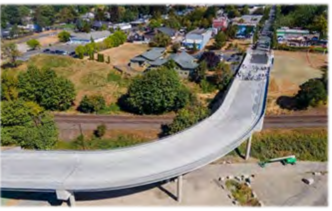
Pioneer Street Rail Overpass (Ridgefield)