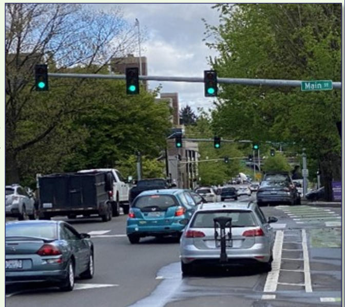
Timed traffic signals along Mill Plain, downtown Vancouver