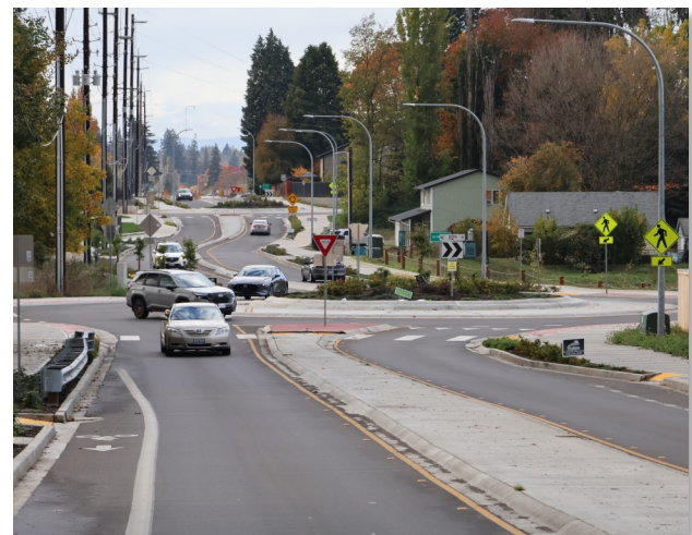
Roundabout at 99th St and 112th Av, Vancouver