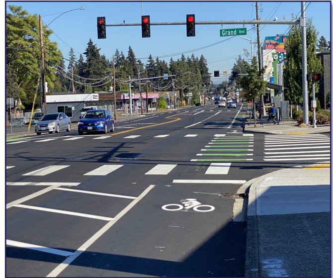
Fourth Plain Blvd at Grand Blvd, Vancouver