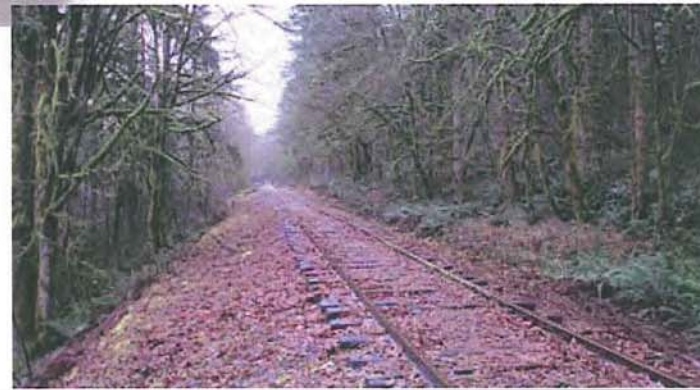
Far left: Crossing NE Fairground Ave.