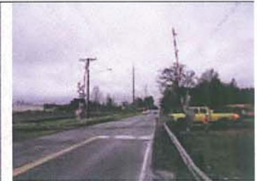
The interim route following NE 142nd Avenue to NE 199th Street.