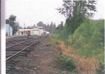
Battle Ground Yard at MP-14 approaching East Main Street in downtown Battle Ground.