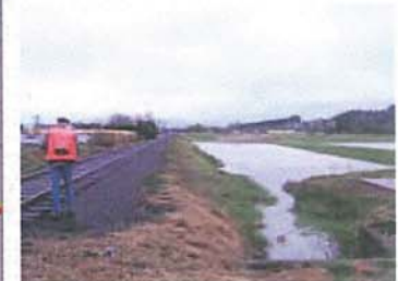
Coordinate alignment north of NE 199th Street with adjacent development.