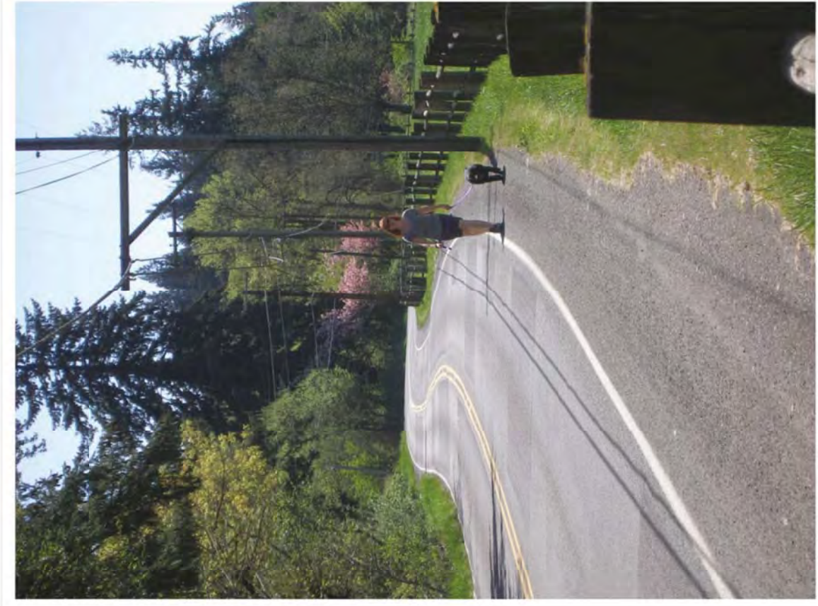
Salmon Creek Avenue Multi-Use Pathway Washington State University Entrance to Pleasant Valley Park