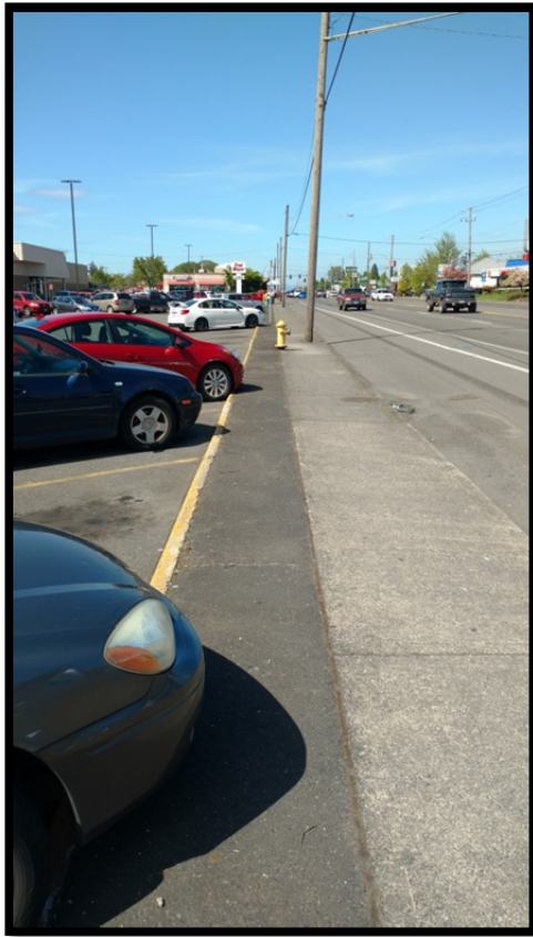
Before – Fred Meyer frontage