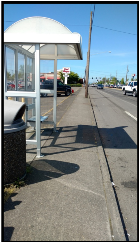
Before – C-TRAN transit stop