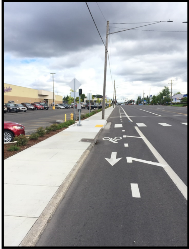
After – Fred Meyer frontage @ HAWK crossing